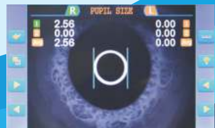
Pupil size measurement

With the pupil size measurement function, which enable to record the pupil size and refraction result in different measurement environment, and provide a reference for the prescription.