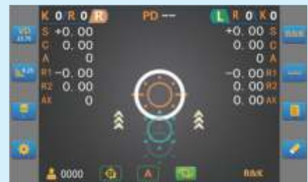
Auto tracking ( Y axis )

The auto tracking function provides the focusing more fast, and reducing the work load sufficiently.